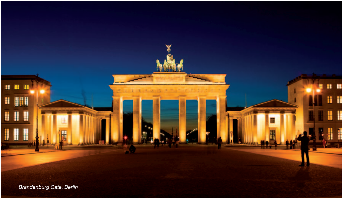
Brandenburg Gate, Berlin