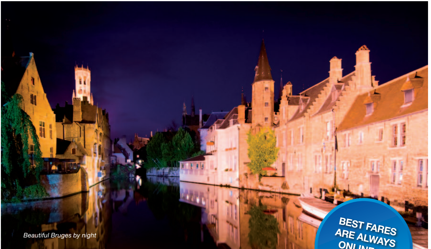
Beautiful Bruges by night

BEST FARES ARE ALWAYS ONLINE AT norfolkline.com